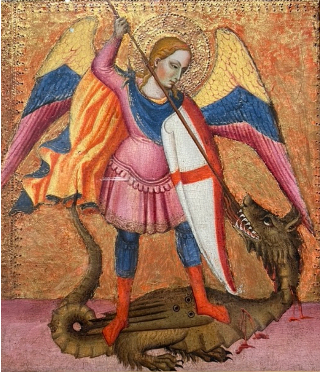
Archangel Gabriel slaying the Dragon (c. 1400), Master of Saint Verdiana