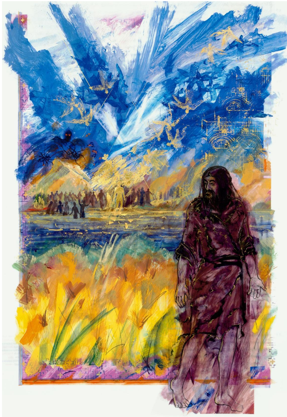
Cover image: Baptism of Jesus, Donald Jackson, © 2002 The Saint John's Bible, Saint John's University, Collegeville, Minnesota, USA. Used with permission. All rights reserved.